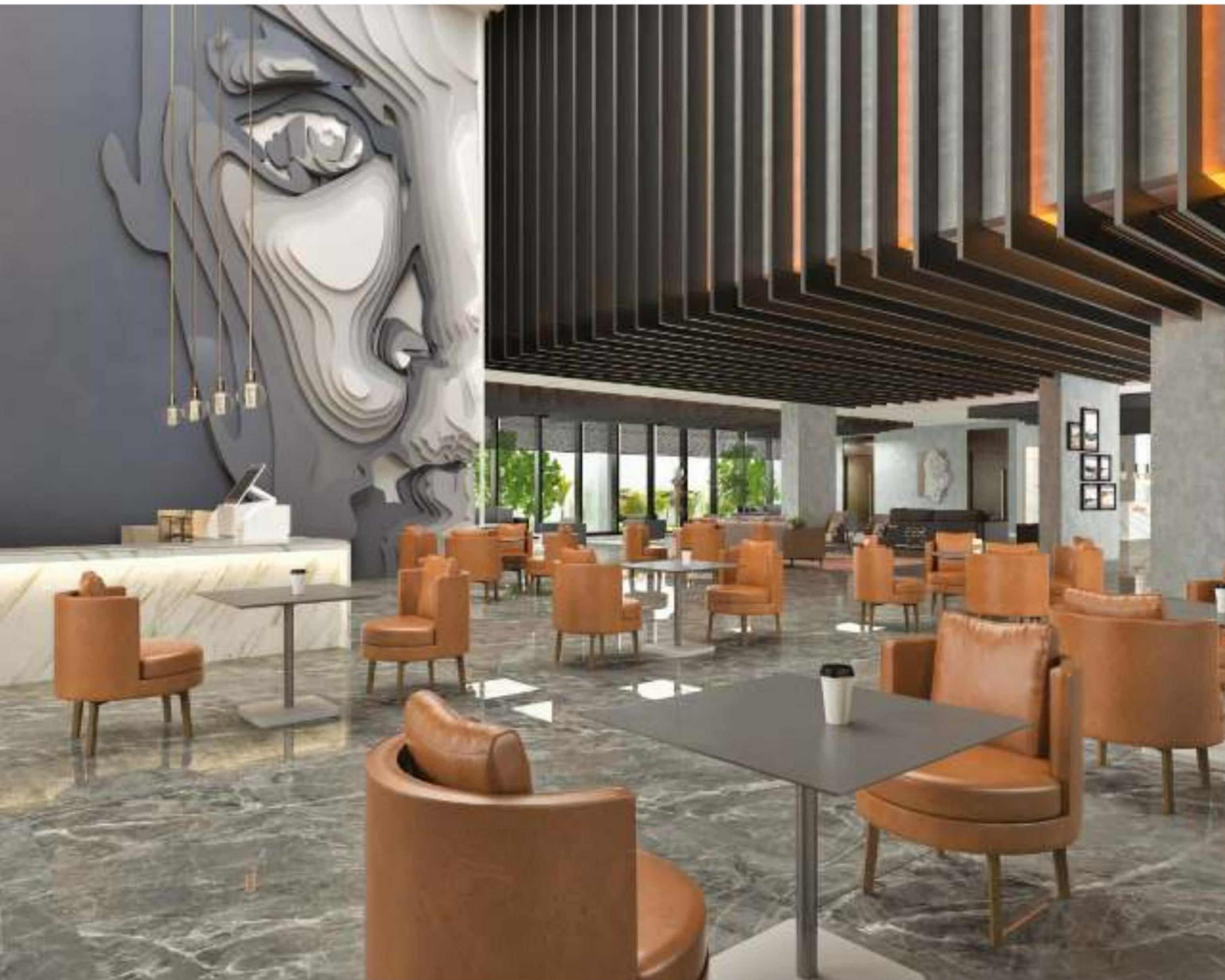
CAFÉ & LOUNGE