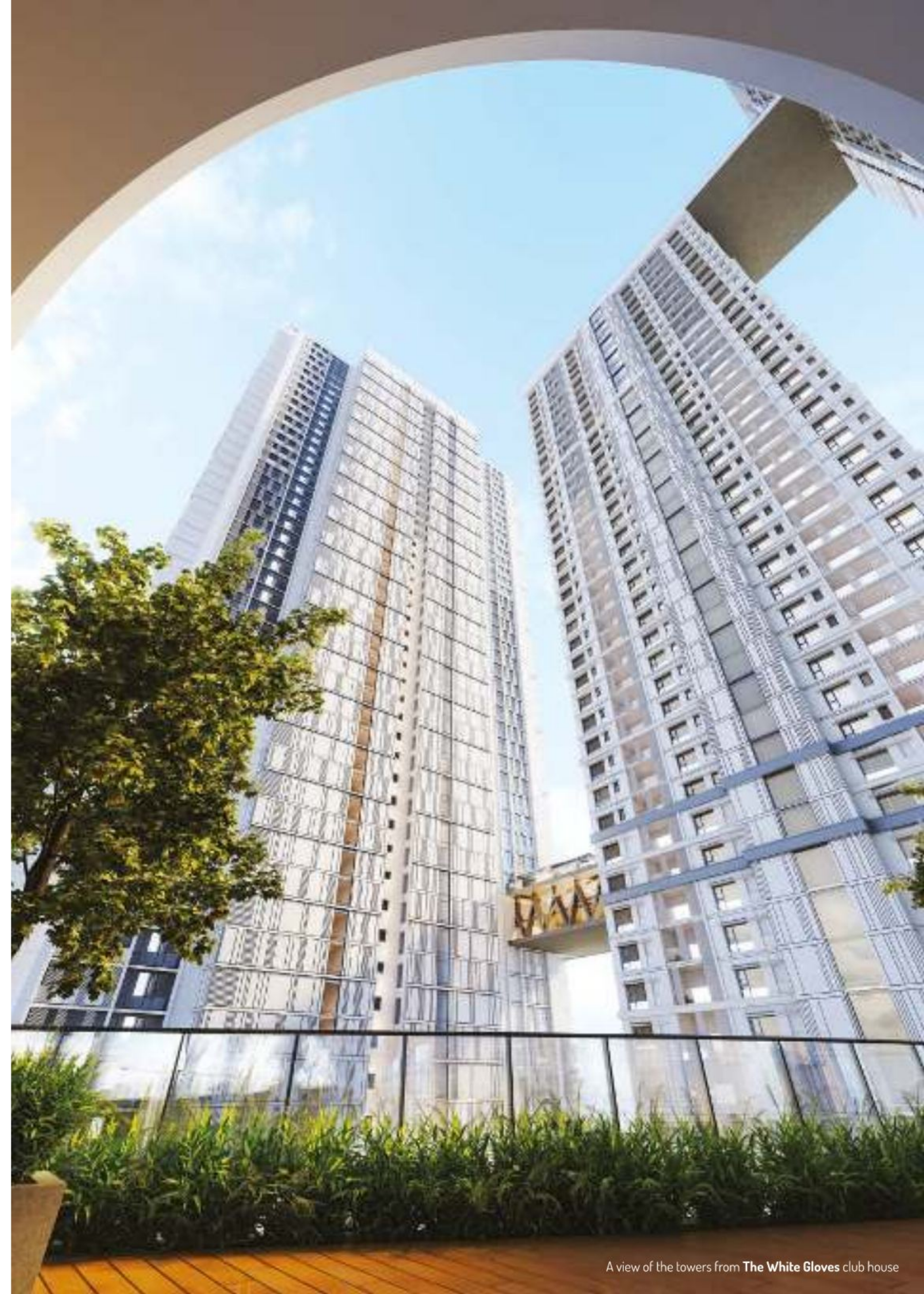
A view of the towers from The White Gloves club house

Rigel is our 3 rd wonder and spans 49 floors offering convenient sizes of 2,888 square feet and 3,666 square feet each. This tower connects to the "Up & Above" club house and offers smart recreational experiences.