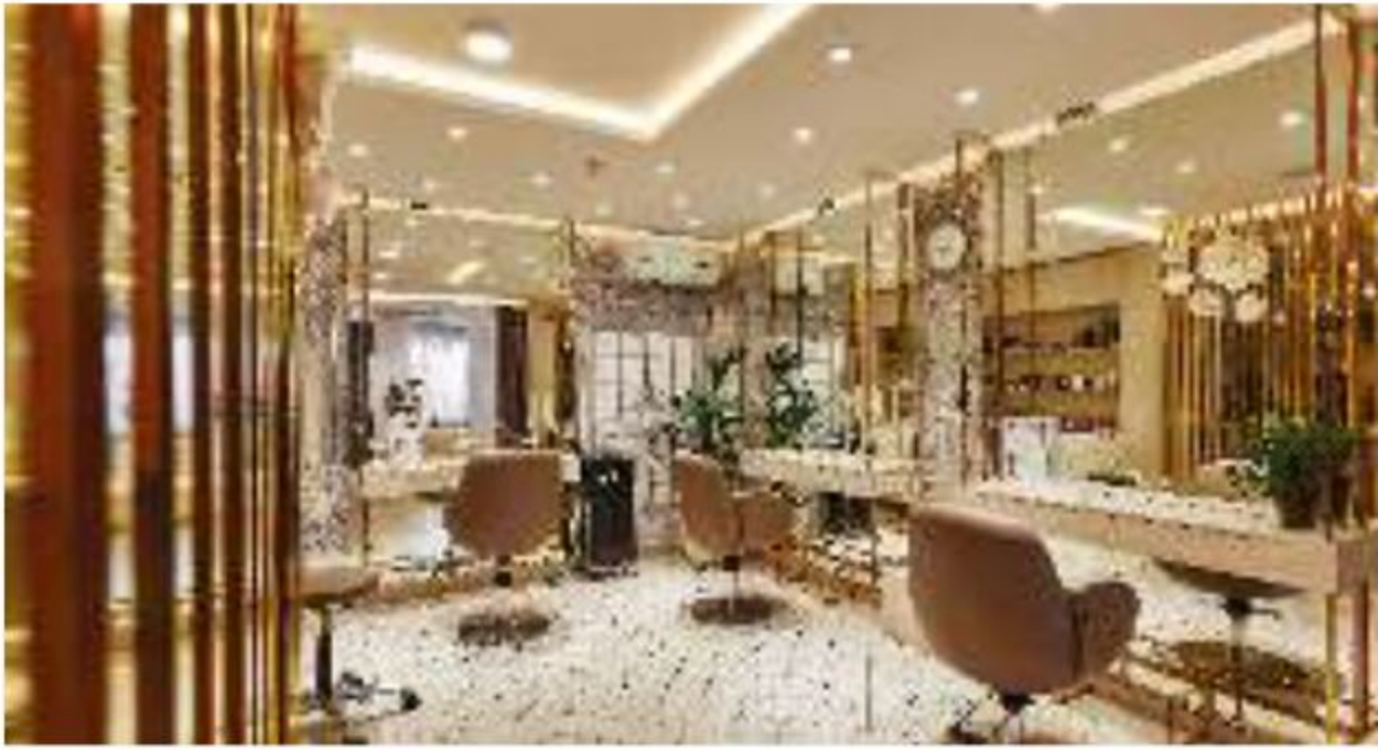
SALON AND SPA