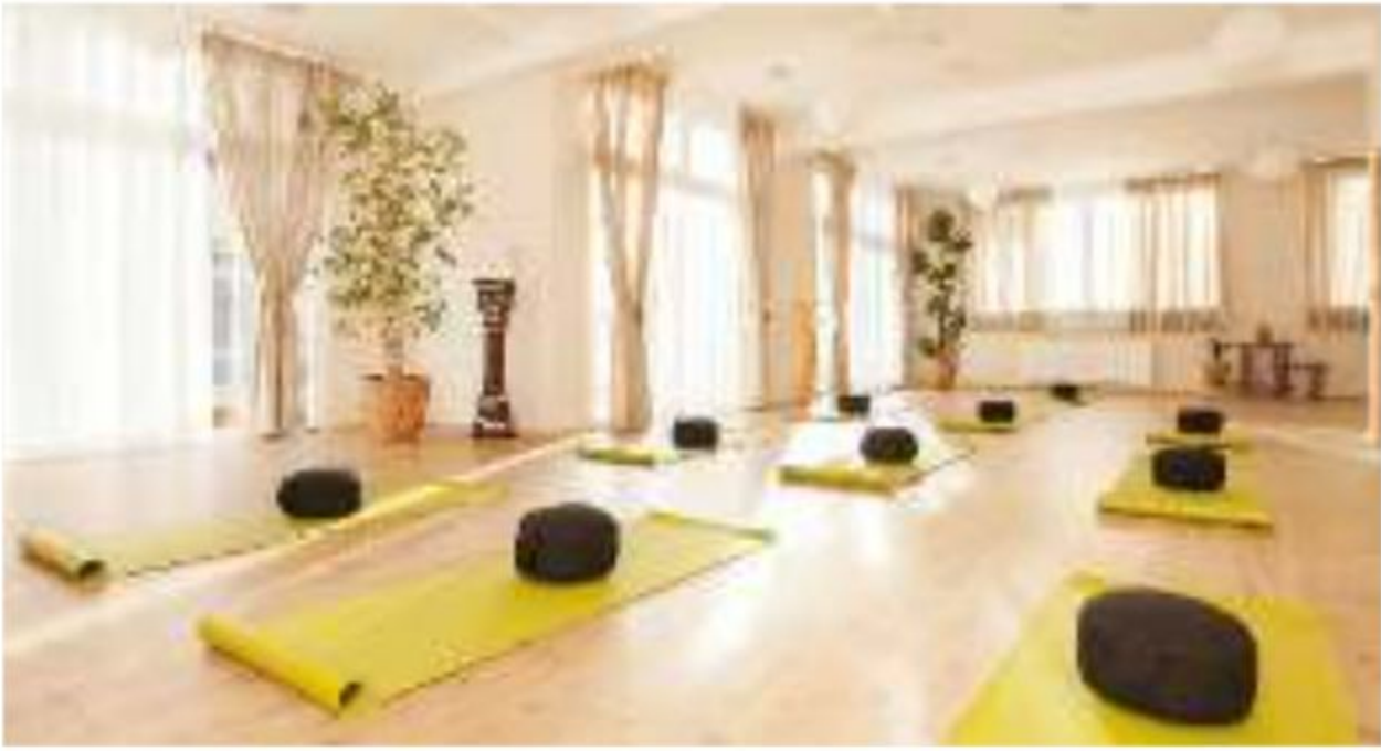
YOGA AND MEDITATION