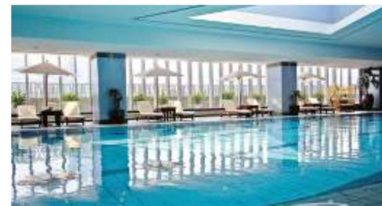
INDOOR SWIMMING POOL & KIDS POOL