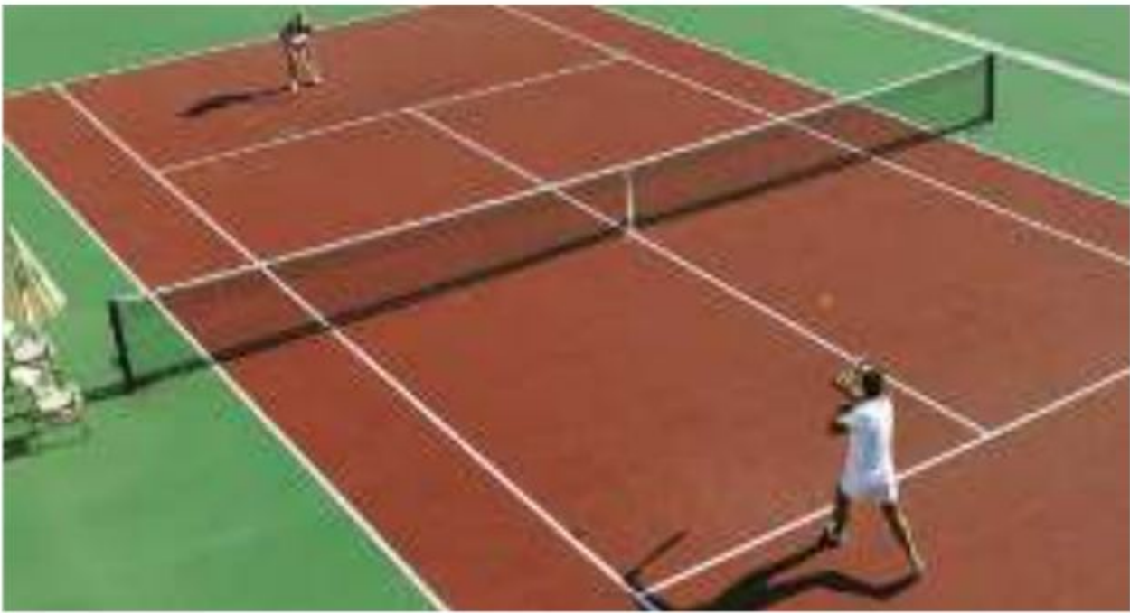
ROOFTOP TENNIS COURT